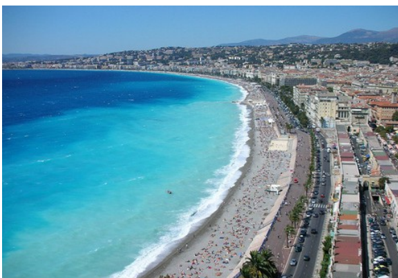
Bay of Angels

The Cap of Antibes is divided into two bays, the Bay of Angels and the Bay of Golfe-Juan. Each zone has its own watershed and particular hydrodynamics :