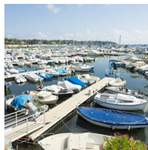
Port of Croûton

These marinas have been part of our coastline for many years. They can welcome all types of boat, from the largest (150 meters) to the most traditional, such as the " pointu ". A large number of specialist manufacturers and artisans offer their services to the yachting world. Nautical activity generates 2,500 jobs in the commune.