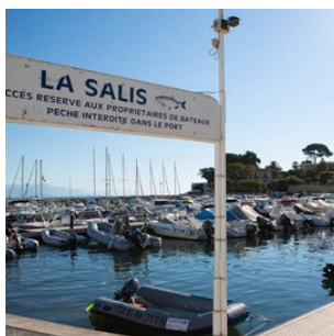
Port of the Salis