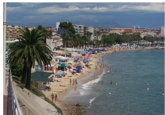
Bay of Golfe-Juan